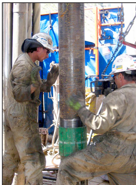
Workers conduct drilling operations.

By Robin Mackar reprinted from eFACTOR , December 2011