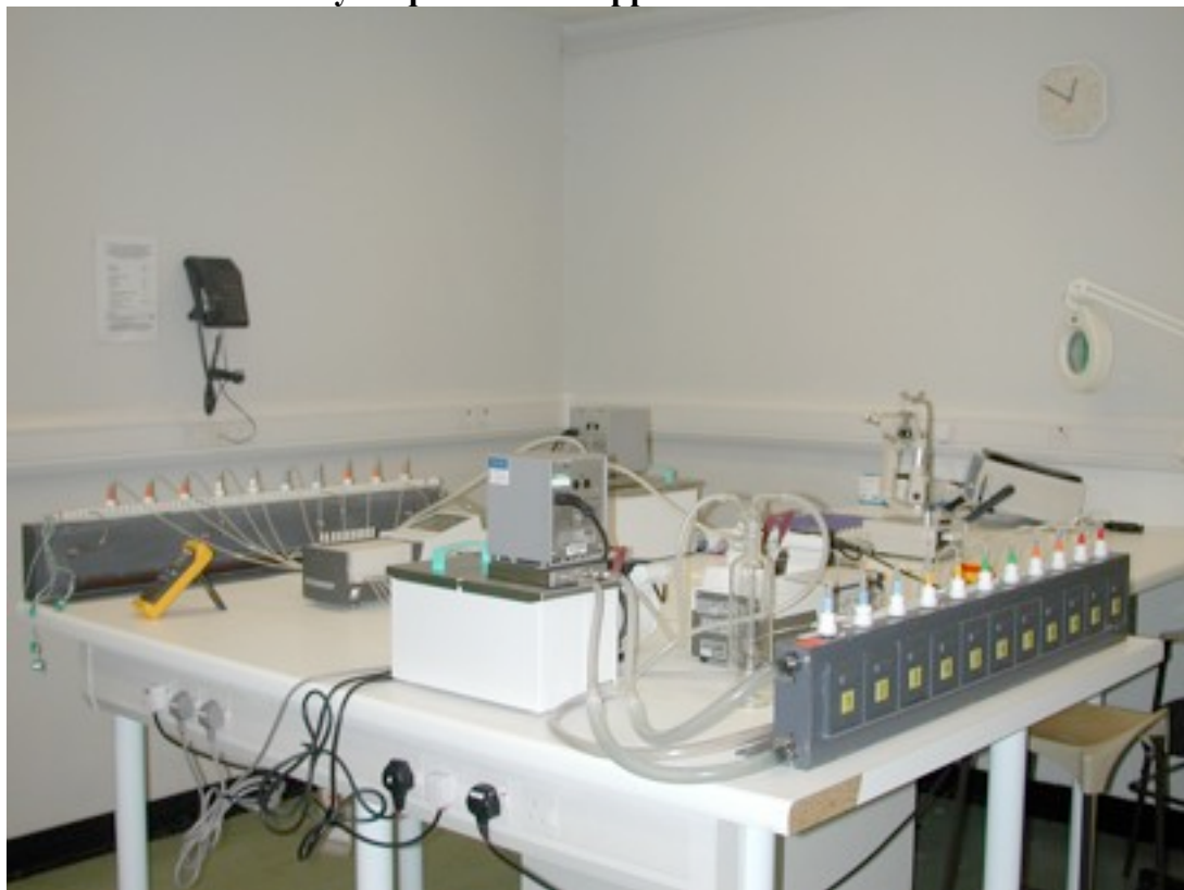
Figure F-1 Isolated Rabbit Eye Equilibration Apparatus