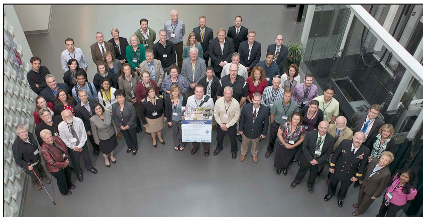
Above are the participants of the NICEATM-ICCVAM International Workshop for Leptospira Vaccine Potency Testing, U.S. Department of Agriculture Center for Veterinary Biologics, Ames, IA, September 19-21, 2012.

In the United States and other countries, Leptospira vaccines are used in cattle, swine, and dogs to protect them from disease and to reduce the risk of animal-to-human transmission. Manufacturers test the potency of vaccine lots prior to their release to ensure their effectiveness. However, methods currently used to test the potency of Leptospira vaccines