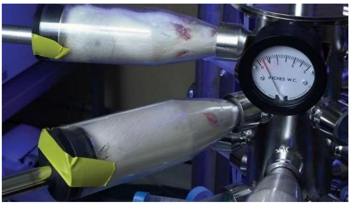
Rats confined in forced inhalation chambers