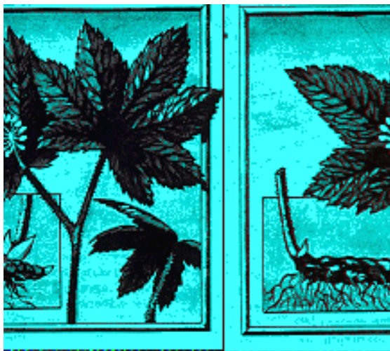
Illustration from Hamon (1990)